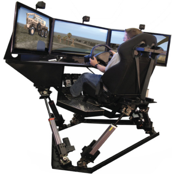
HexDS simulator running TruckSim RT