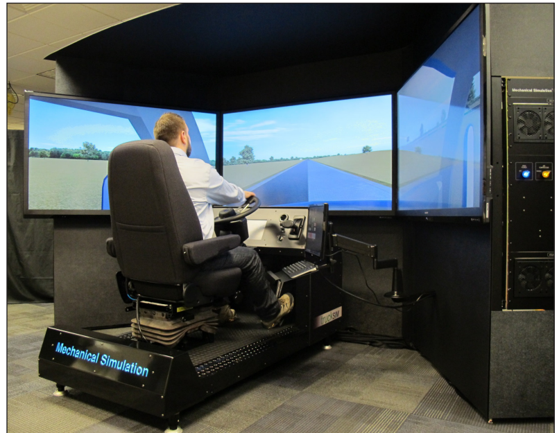
QuadDS simulator running TruckSim

The simulators use the same CarSim and TruckSim software used by a majority of the world's automotive manufacturers and Tier 1 suppliers. Companies already using Mechanical Simulation software can drive the same vehicle data and controller models (SIL or HIL) that have been developed and validated by their engineering departments.