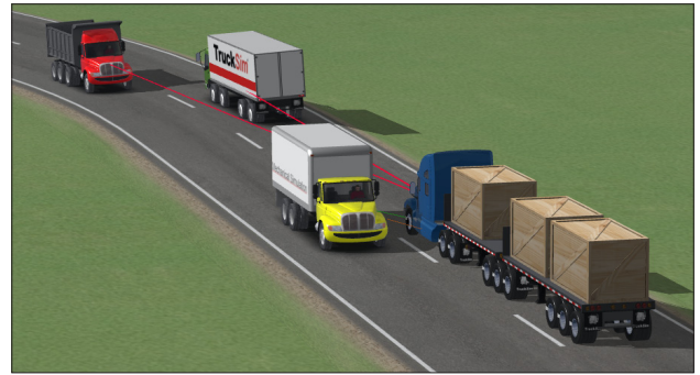
Sensor feature for developing active safety systems