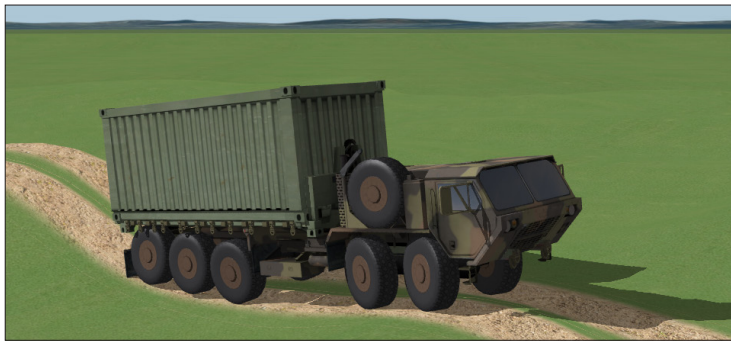
High fidelity math models and detailed 3D road geometry